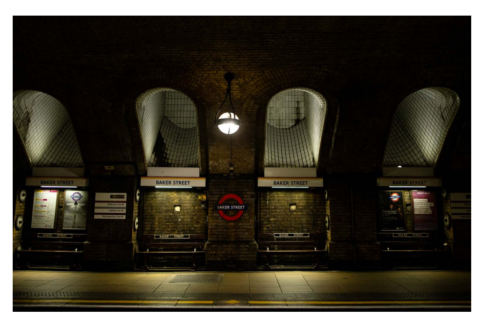
Original platforms at Baker Street, 2023.

For more information about the history of the site, the context in which it was built, and other underground structures, the following publications are recommended: