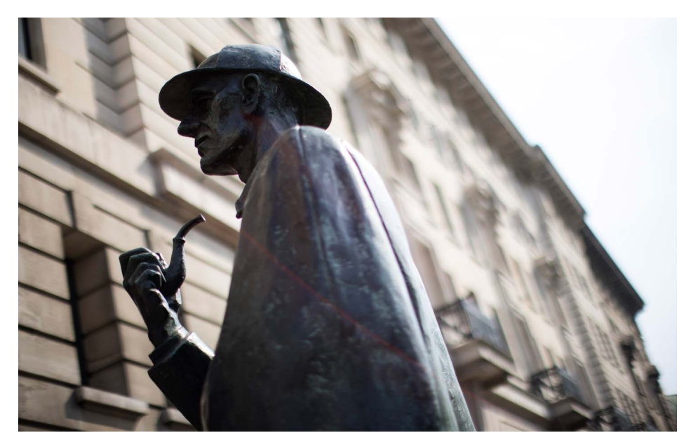
Statue of Sherlock Holmes outside Baker Street station, 2023.