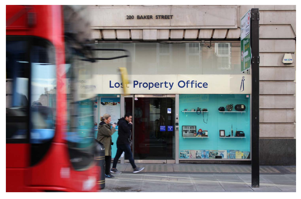
The Lost Property Office at Baker Street in October 2019, shortly before moving to South Kensington. 2019/2137