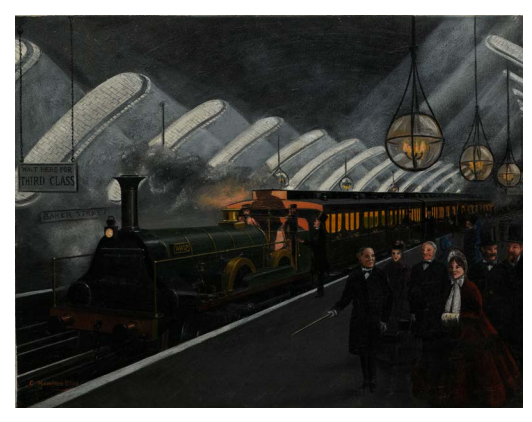
Painting depicting the Baker Street platforms in 1863, by 20th century artist, C. Hamilton Ellis. 1987/ 85