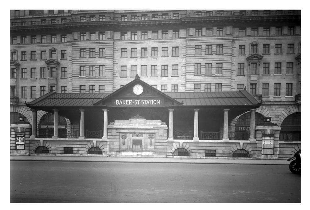
Baker Street Underground station, with portico (destroyed in the Second World War) and Chiltern Court in the background. 2003/18870