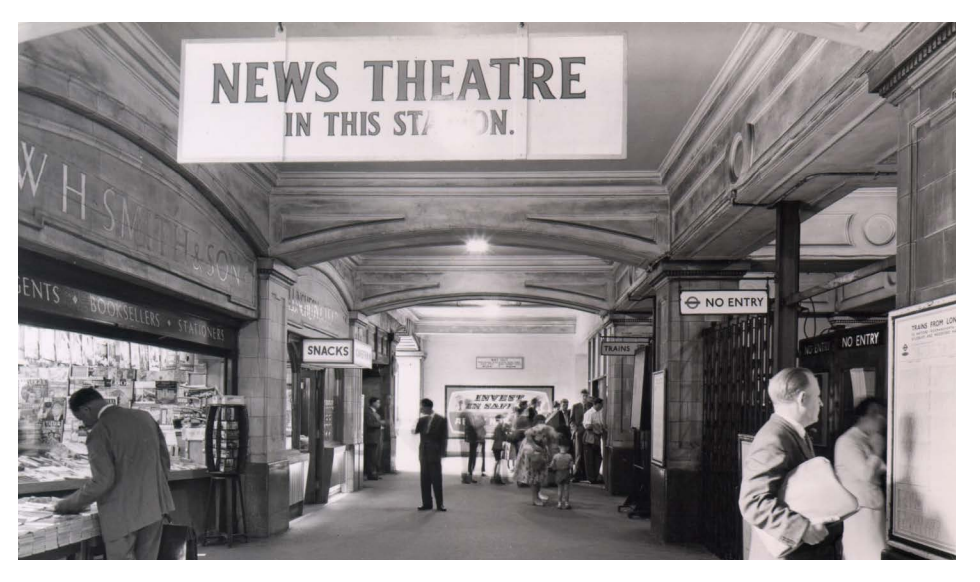
Shopping arcade in the ticket hall at Baker Street station, 1958. The station had one of the longest-standing news theatres in London. 1998/88642

The days of the Metropolitan Railway as an independent company were now numbered. In 1933 the London Passenger Transport Board (LPTB) was formed, taking over the company and all its services.